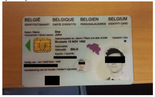
Figure 2: A "John Doe" example of our altered ID card. Metadata of the PNG file such as the image dimension was also modified to increase the credibility of it being captured by a real photo camera.

The email spoofing types used for each organization are abbreviated in Table 3 as "Res", "Rin" and "Rep" for respectively The Resembler, The Ringer and The Reply-To.